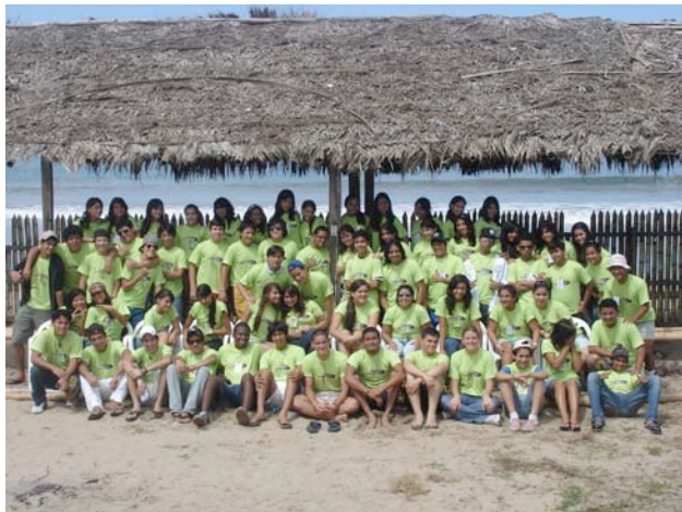
Venezuela... a SEMP training conference in Venezuela with a group of student leaders... teaching them to be “fishers of men” (left)

Here are some of the reports I have received recently from various leaders globally: