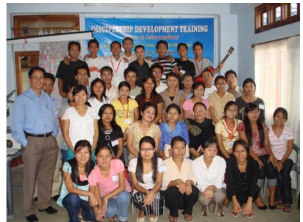
Jakarta Indonesia... denominational leaders being equipped in the Life of Christ training. The manual has been translated into Bahasa language. These leaders represent 170 churches and over 17,000 believers in Indonesia.